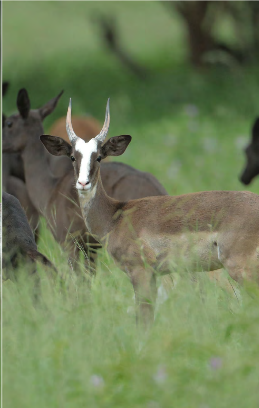
Example of a ram (photo at 12 months)