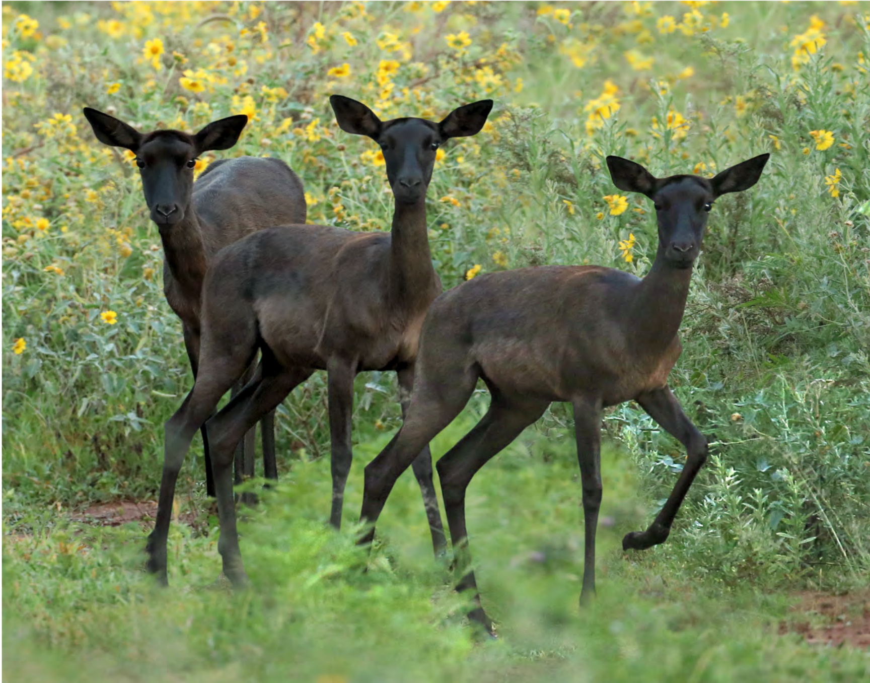
Example of sub-adult Black Impala ewes

Young, 15/16-month-old Black Impala ewes that are open and ready for the ram of your choice. A perfect boost for your Dappled Impala breeding project.