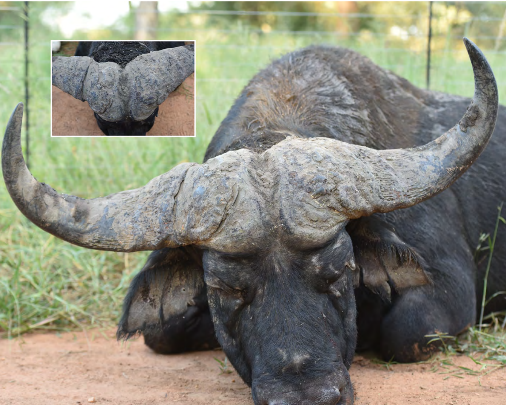
Red 3 - 43 2/8"