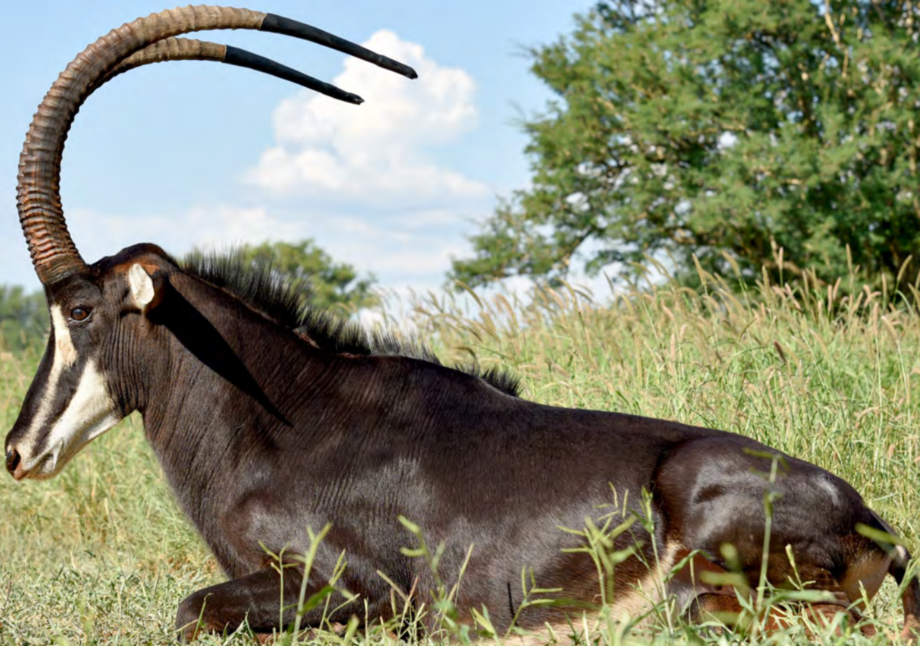
A171 - 44 7/8" with a tip-to-tip of 18"

Perfect trophy Sable bull with symmetrical horns and a tip-to-tip of 18".