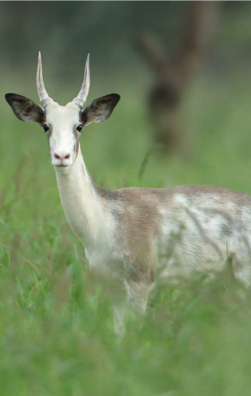
Example of a ram (photo at 12 months)

On offer is a 15/16-month-old Dappled Impala ram. Our Dappled Impala rams are born and bred on Tembani Wildlife in the Thabazimbi area which is well known for big-bodied and large-horned Impala. The buyer will have the option to choose his ram from the herd. Available immediately.