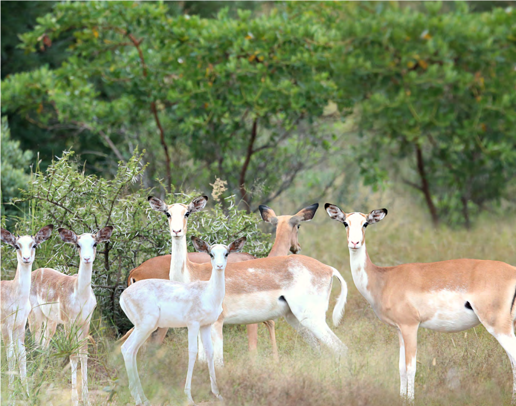
Example of White Flank Impala ewes

5 x White Flanked Impala ewes bred out of our Dappled Impala breeding project. These ewes will be sub-adult ewes ready for your ram.