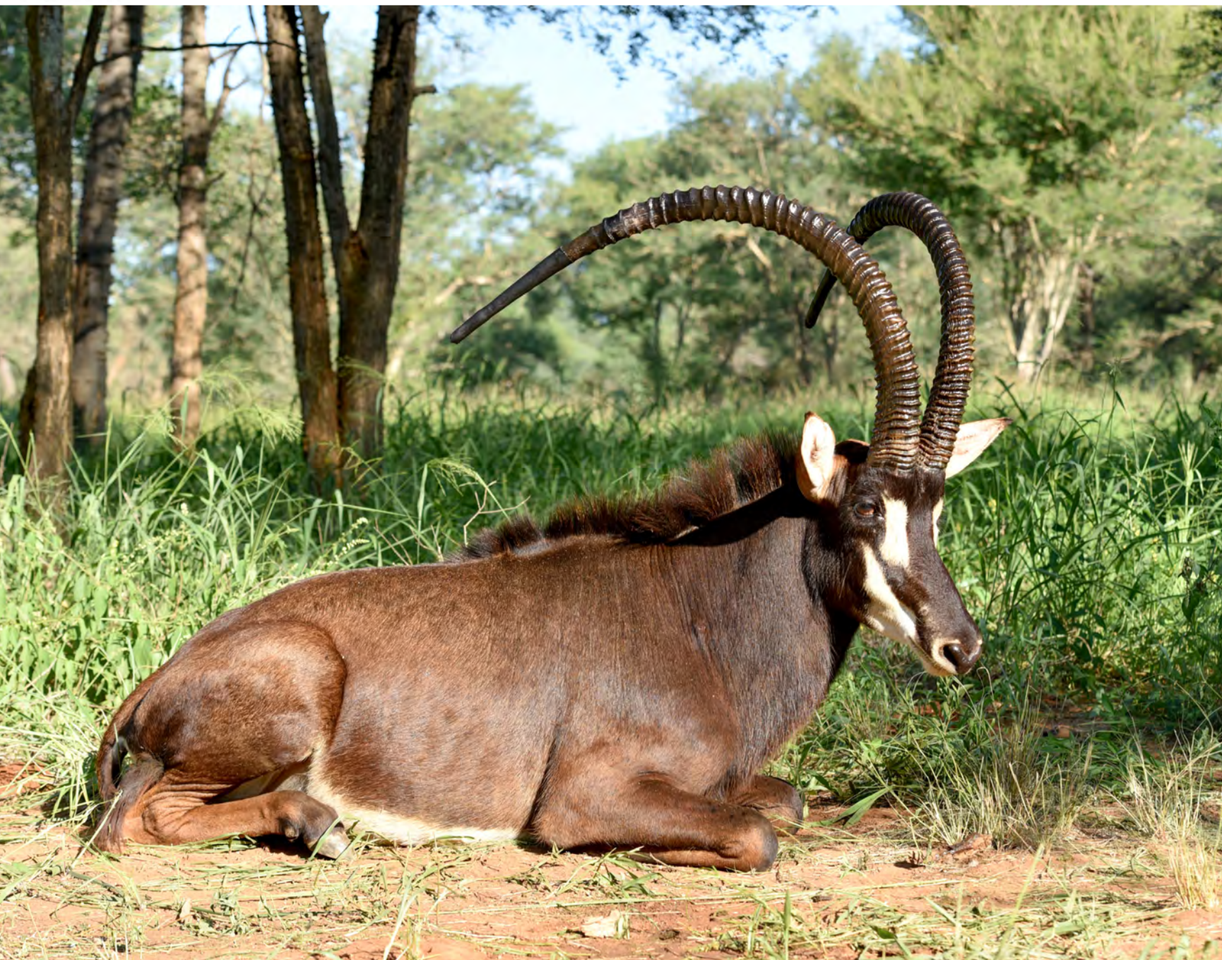
I8 - 48 4/8" with a tip-to-tip of 35 4/8" at 5y10m

Other info: Potentially a 50" Zambian bull bred out of Deuce and E105 (who is a daughter of E14). I8 is perfectly symmetrical with a wide horn shape. This bull shows off all his Zambian characteristics with a beautiful black mask.