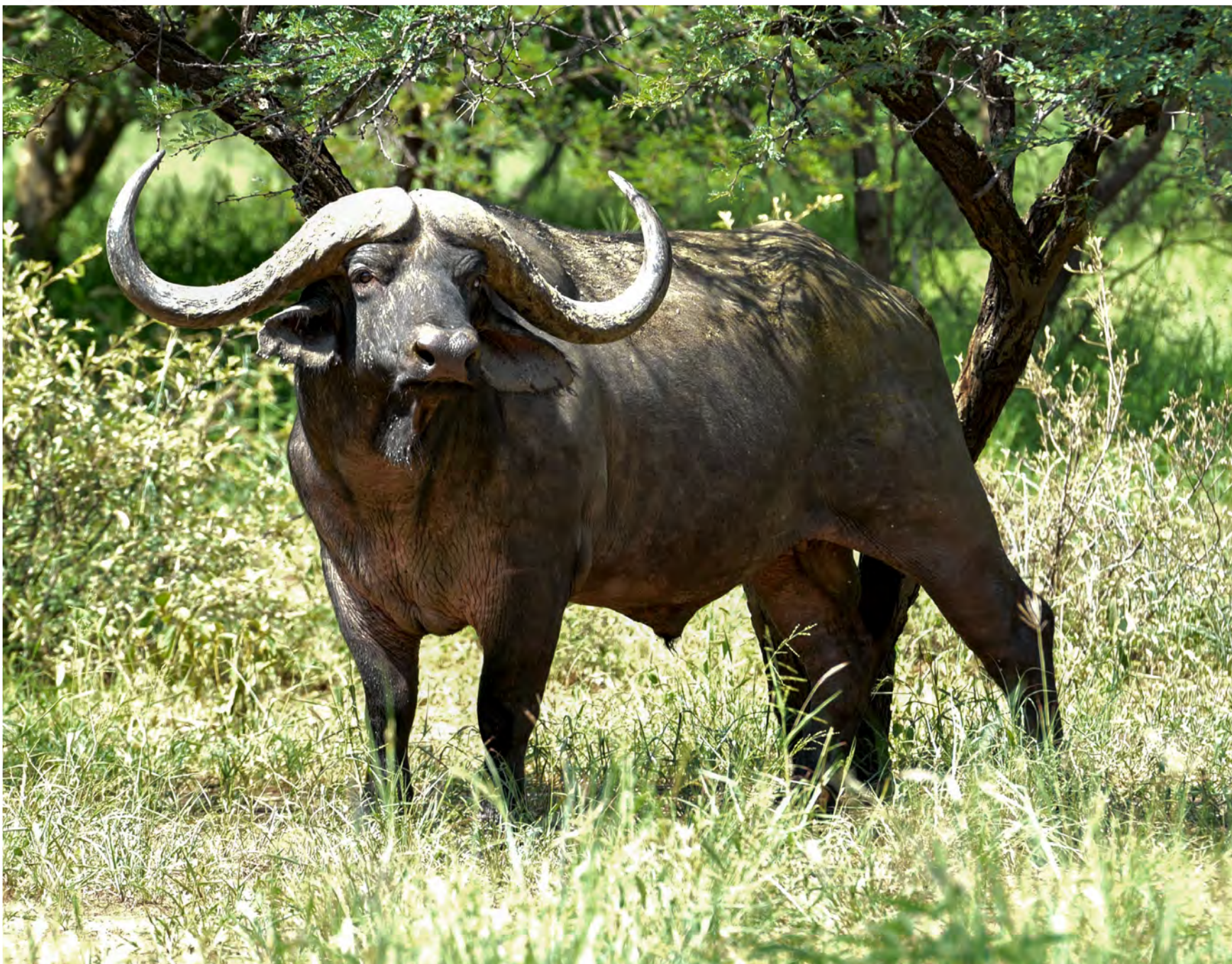
Red 7.01 - 49 2/8" Buffalo Bull

Other info: A large-bodied, hard-bossed buffalo bull over 8 years of age. A perfect hunting bull for a trophy collector who wants to hunt a bigger than average buffalo bull or for a breeder looking for new blood. This bull damaged his left eye years ago, but has been unaffected by his injury.