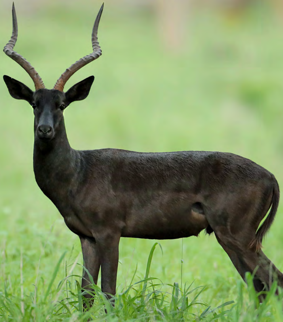
Example of an adult Black Impala ram

5 x Black Impala trophy rams. These animals are big-bodied, Thabazimbi born and bred Impala rams. Open horn shaped rams, suitable for the trophy hunting market, will be selected during capture.