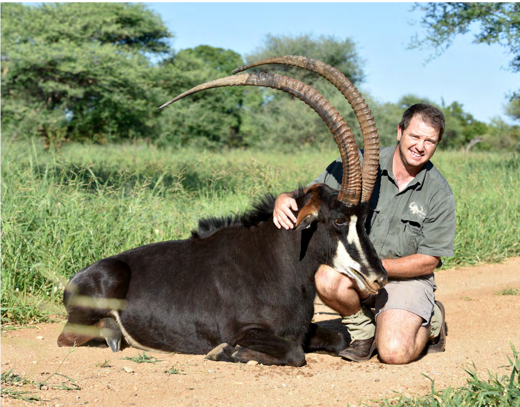
A176 - 47 4/8" at 5y7m with a tip-to-tip of 22 4/8"

Other info: A176 is a large bodied and well balanced sable bull. He measures 47 4/8" and has a good tip-to-tip of 22 4/8". A176 is born out of our Katavi and Rapella lines and promises further growth. He could be used as either a breeding bull, or as an impressive prize for a trophy hunter.